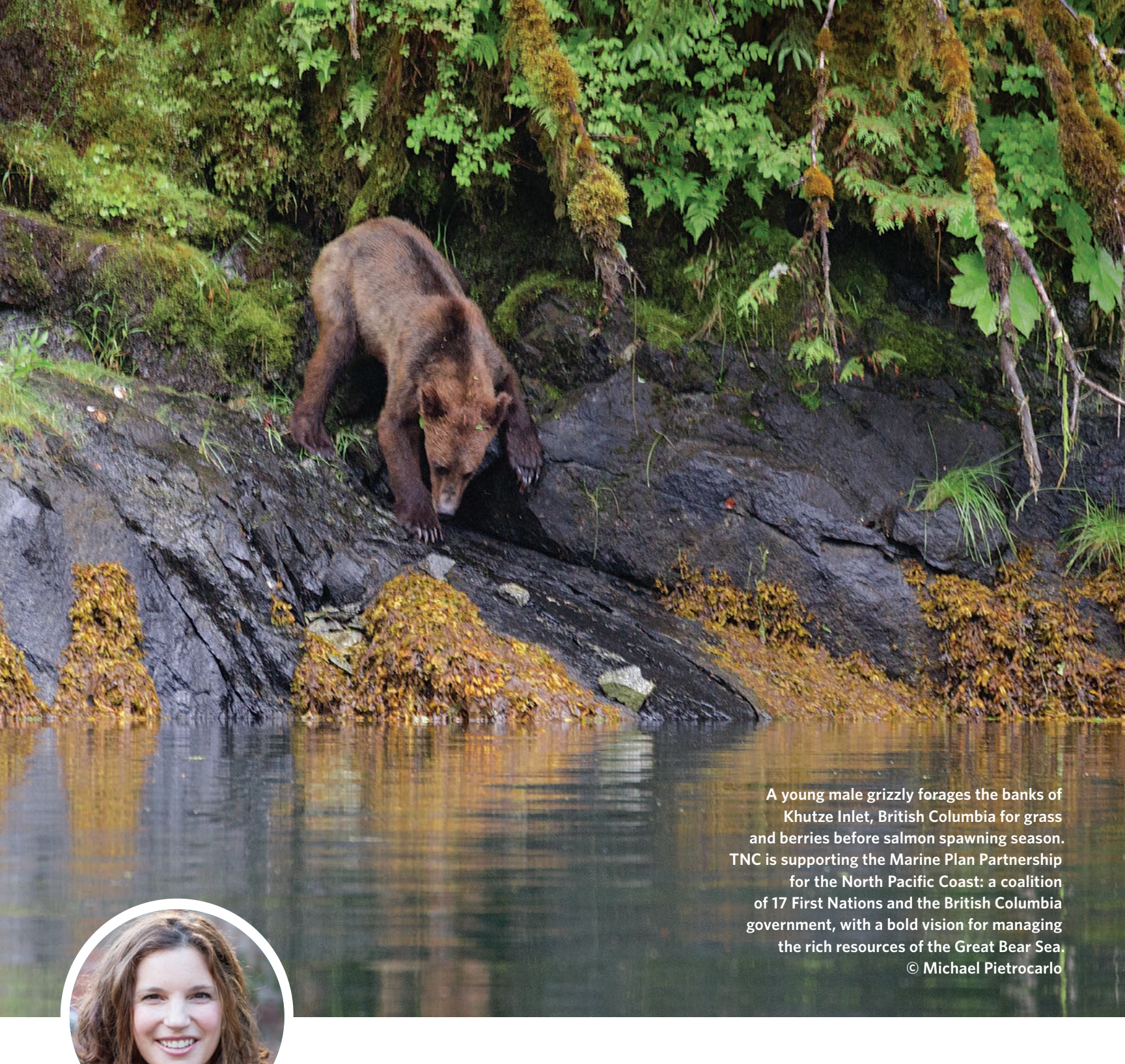
Making an Impact